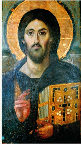
Visual Source 10.1 Christ Pantokrator Chapter 10, Ways of the World: A Brief Global History with Sources , Second Edition Copyright © 2013 by Bedford/St. Martin's Page 509