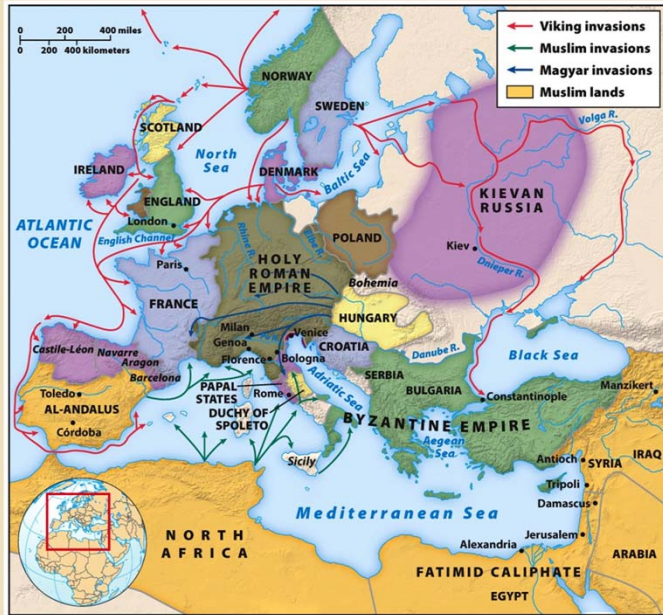
Map 10.3 Europe in the High Middle Ages Chapter 10, Ways of the World: A Brief Global History , Second Edition and Ways of the World: A Brief Global History with Sources , Second Edition Copyright © 2013 by Bedford/St. Martin's Page 333 (page 481, With Sources)