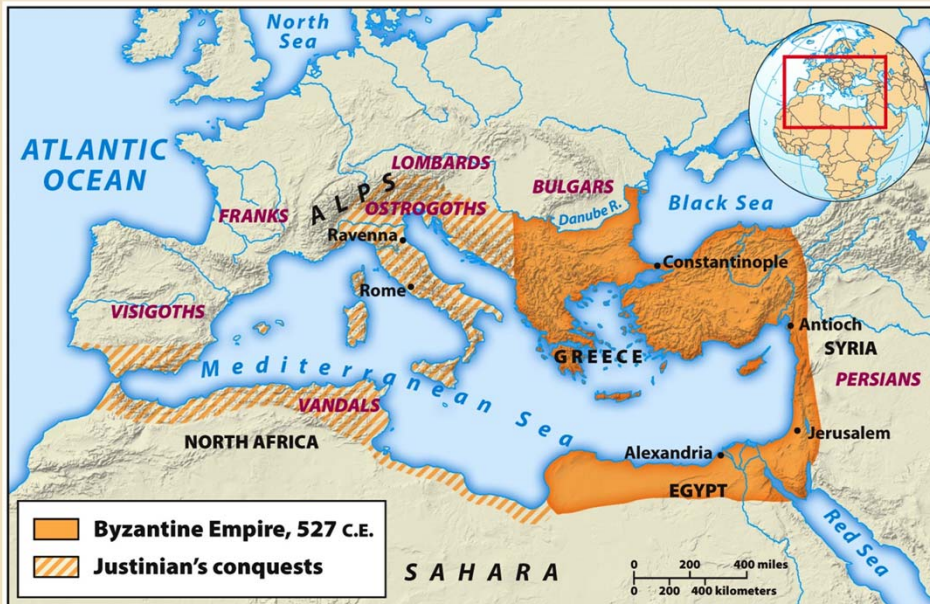
Map 10.1 The Byzantine Empire Chapter 10, Ways of the World: A Brief Global History , Second Edition and Ways of the World: A Brief Global History with Sources , Second Edition Copyright © 2013 by Bedford/St. Martin's Page 323 (page 471, With Sources)