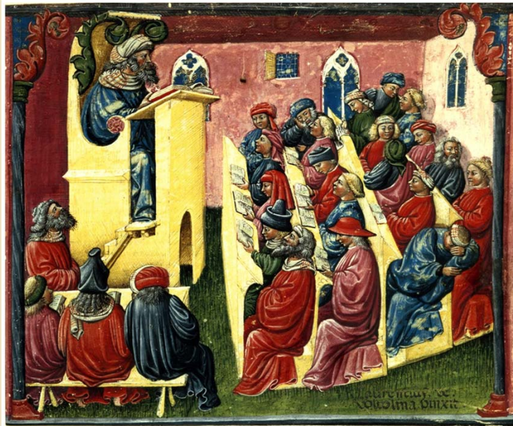
European University Life in the Middle Ages Chapter 10, Ways of the World: A Brief Global History , Second Edition and Ways of the World: A Brief Global History with Sources , Second Edition Copyright © 2013 by Bedford/St. Martin's Page 346 (page 494, With Sources)

1. Describe the scene in this painting. Who are these people, and what type of building are they in?