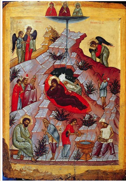
Visual Source 10.2 The Nativity Chapter 10, Ways of the World: A Brief Global History with Sources , Second Edition Copyright © 2013 by Bedford/St. Martin's Page 510