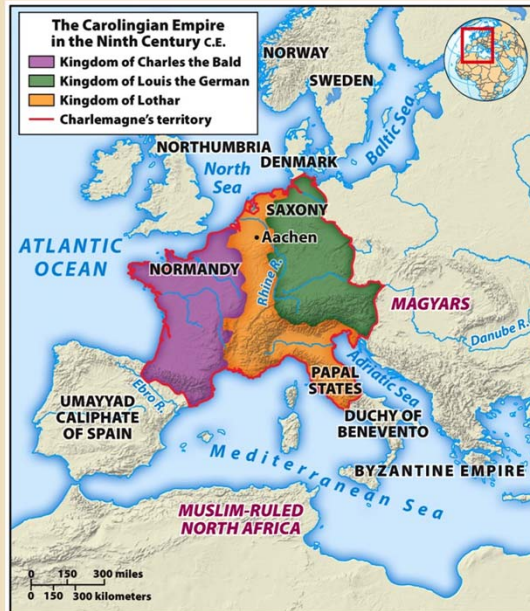
Map 10.2 Western Europe in the Ninth Century Chapter 10, Ways of the World: A Brief Global History , Second Edition and Ways of the World: A Brief Global History with Sources , Second Edition Copyright © 2013 by Bedford/St. Martin's Page 330 (page 478, With Sources)