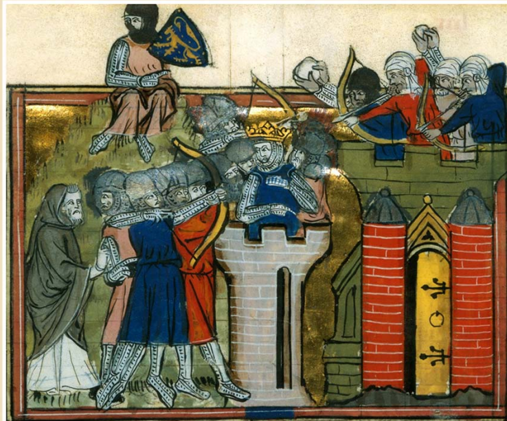
The Crusades Chapter 10, Ways of the World: A Brief Global History, Second Edition and Ways of the World: A Brief Global History with Sources, Second Edition Copyright © 2013 by Bedford/St. Martin's Page 340 (page 488, With Sources)