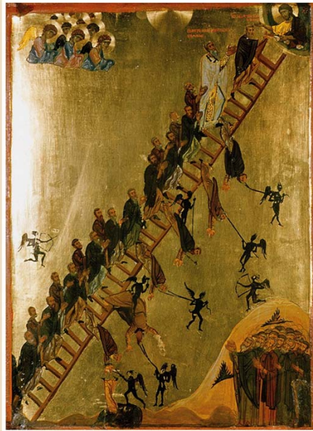
Visual Source 10.3 Ladder of Divine Ascent Chapter 10, Ways of the World: A Brief Global History with Sources , Second Edition Copyright © 2013 by Bedford/St. Martin's Page 511